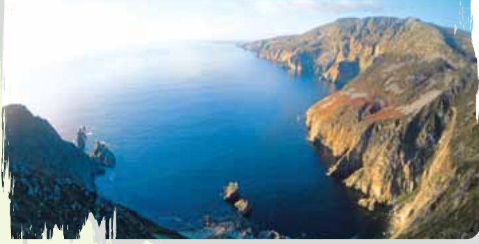
Slieve Donard - Europe's Highest Sea Cliffs

Or take time to visit the historic city of Derry, taking in the City Walls, Museums, and Cultural attractions, before visiting the Roe Valley and the attractive town of Limavady.