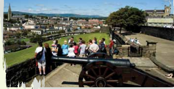
City Walls, Derry

The peaks of Binevenagh and Benbradagh mountains are a sight to behold. The views from the top are exceptional, providing views to the southern Sperrins and County Donegal. Website: www.limavady.gov.uk