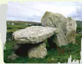
Standing Stone & Dolmen at Gleanncholmcille