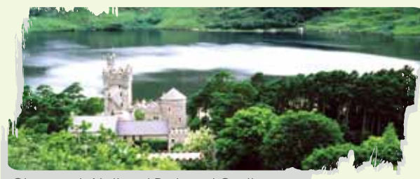
Glenveagh National Park and Castle