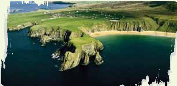
Malinbeg & Mor, An Trá Bán beach

Europe's Highest Sea Cliffs, Slieve Donard . Leave your car at the car park and walk the few miles to the cliffs, and prepare yourself to be blown away by the majesty and beauty of Ireland's most spectacular visitor attraction. There are terrific views of the Atlantic Ocean, the Sligo Mountains and Donegal Bay as you walk towards the terrifying high top of Slieve Donard, where the cliff face rises over 600m.