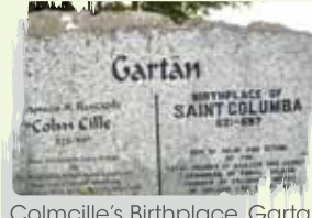
Colmcille's Birthplace, Garton

Visit the Colmcille Heritage Centre located on the shores of Lough Garton . The centre tells the story of the growth of Christianity in Ireland and throughout Europe, in the period at the end of the Roman Empire. The life of Colmcille is depicted in a fascinating audiovisual piece, as well as a special tapestry display of the Derryweagh Evictions and a Heritage trust art collection. Seasonal Opening. Website: www.colmcilleheritagecentre.ie