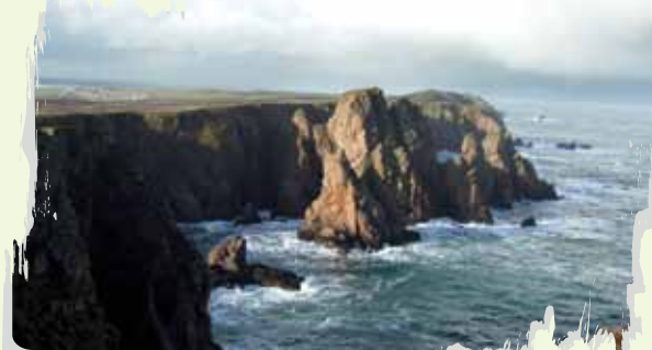
Tory Island Cliffs

The ancient custom of the crowning of the 'King of Toraigh' is a tradition alive and well today. A visit to Toraigh will give you the chance of encountering Ireland's only monarch on your travels! Website: www.oileanthorai.com