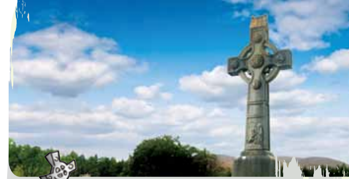
Colmcille's Birthplace, Garton, County Donegal

Colmcille returned to Ireland for the convention of Drumceatt in 575AD, where the High King of Ireland, nobles, clerics, poets and historians met at Mullagh Hill, located at the Roe Park Hotel estate. Presiding over the meeting, legend has it that Colmcille was blindfolded and wore sods of Alba (Scotland) on his feet, so that he could keep a promise he made on exile from Ireland in 565AD.